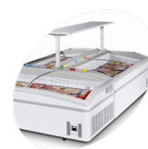
Island installation, shelves as accessory